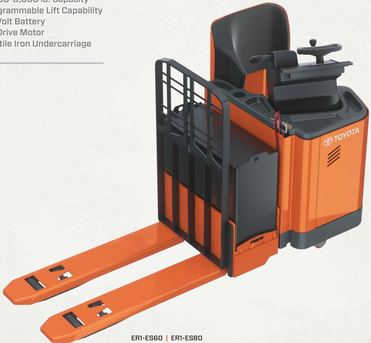
ER1-ES60 | ER1-ES80